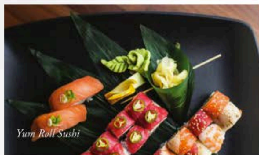
Yum Roll Sushi

My favorite is the Tonkotsu Deluxe ($11.50). This ramen soup has chicken and pork broth, chashu, ajitama egg, menma, moyashi, negi, corn, pork belly, and rayu chili oil. Yum Roll Sushi has some excellent bowls ($7-$9), sashimi ($5-$7), nigiri ($4.50-$6.50) and of course sushi rolls ($4-$11.50). Weirdough Pizza Company is known for its Roman-style, square-cut pizza, made by hand to order in their custom oven. You can get whole-sized pies ($18-$23) or a large slice ($3.75-$4.50).