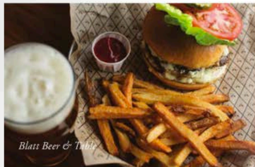
Blatt Beer & Table

Over at Clever Greens everything is bursting with freshness. They have some specialty entree salads ($7.50-$13), or you can build your own creation, specifying every single ingredient. The build-your-own option starts at $7.50. As you might have guessed Yoshi-ya Ramen serves up authentic ramen noodles.