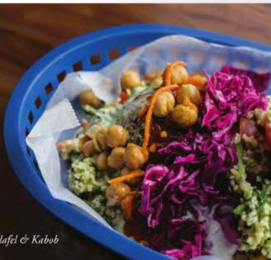
Amsterdam Falafel & Kabob

In the comfortable and open Flagship Commons area, you will find eight different fast casual or full service dining concepts, plus a bar, in one food hall. The list includes: Weirdough Pizza Company, Yum Roll Sushi, Yoshi-Ya Ramen, Clever Greens, Juan Taco, Aromas Coffee House, Amsterdam Falafel & Kabob, and Blatt Beer & Table. As you might guess the hardest part about eating at Flagship Commons is deciding which concept to go to. Well, I have tried all of them and I can tell you that they are all good. It just depends what you like and what you are in the mood for.